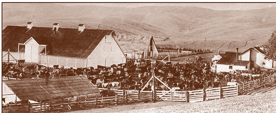
Swiss Italian dairy ranch on San Geronimo creek

In the tiny town of Cayucos, California, you'll hear of many Swiss Italian families. These are names that originated in the Maggia valley and Ticino Canton in Switzerland. Ticino is the canton in Switzerland where Italian is the primary language. So, what brought this Swiss-Italian influence to this and various parts of California's central coast?