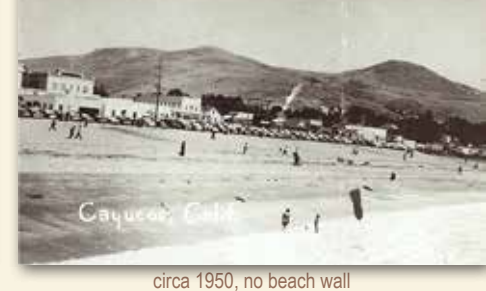
Downtown, circa 1950