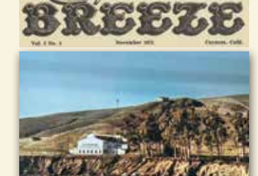
Looking North, circa 1970